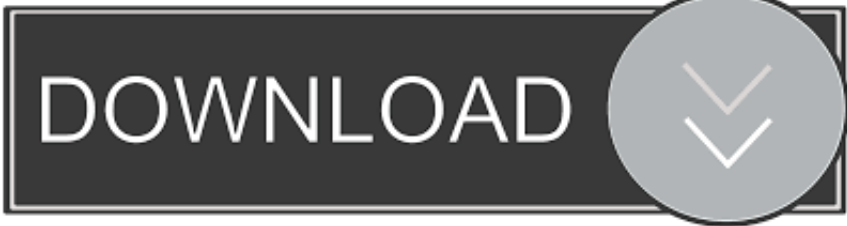
Sonic Robo Blast 2 Wads